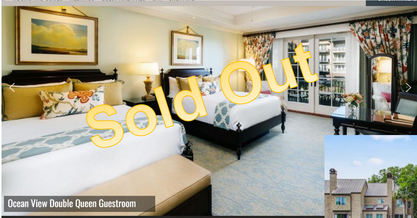
Ocean View Double Queen Guestroom